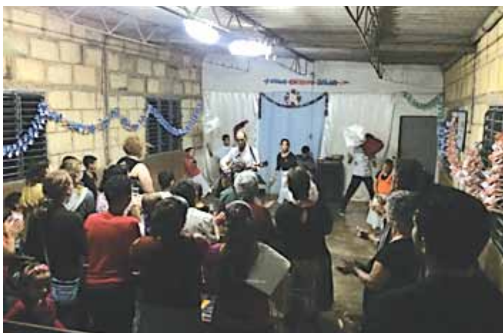
Matanza Bethel Church which has grown from 50 to 1000 members in 20 years.