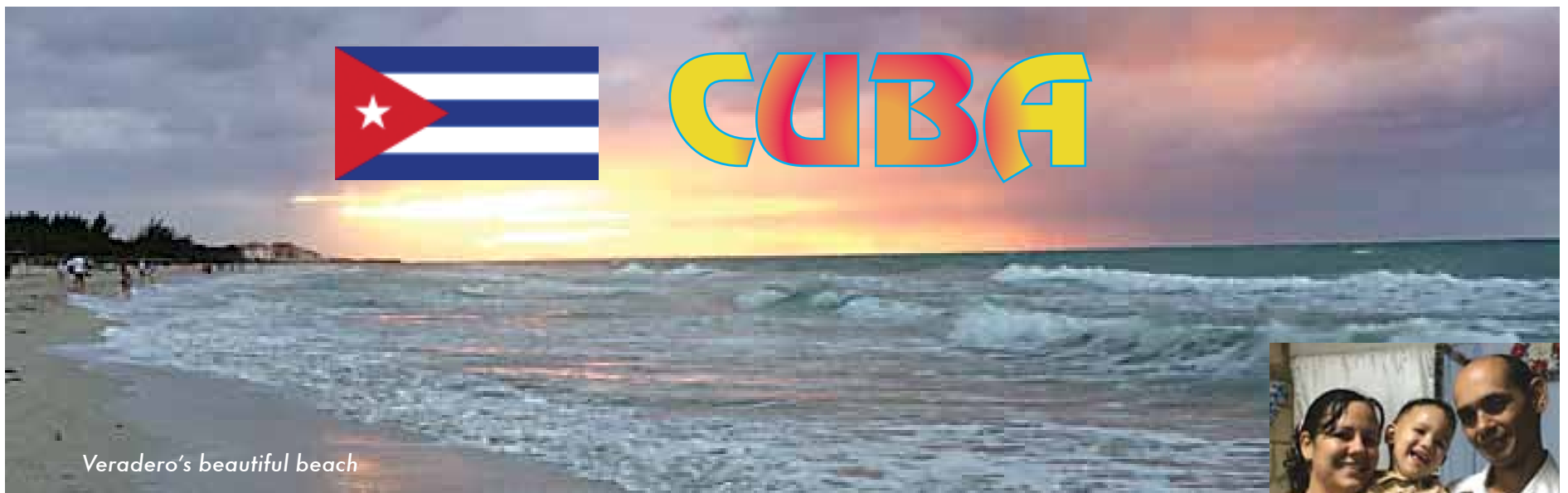
Veradero's beautiful beach

We traveled as a family to Cuba, to see the work my mother passionately talked about, and to meet the Christian friends she holds so close to her heart. She has been to Cuba every year for twenty years now. A group goes from the Finnish and English churches annually.